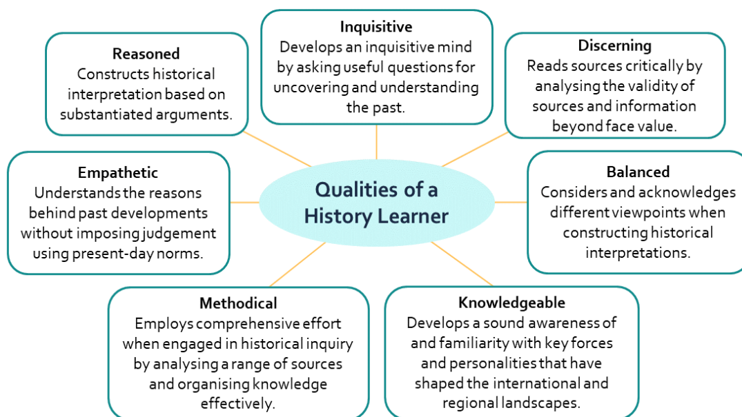
Figure 1. Qualities of a History learner

History prepares students to thrive as citizens in a complex and fast-changing world by equipping them with the knowledge and skills to understand how forces, events and developments of the past shaped today's world. It also develops in students a disciplined and critical mind to discern and make informed judgements based on consideration of multiple perspectives, reasoned and well-substantiated conclusions. History also helps students to participate actively in a globalised world, as they learn to make sense of ambiguous and complex global developments, appreciate local contexts and engage with different cultures and societies sensitively. These are encapsulated in the seven qualities of a history learner which the History curriculum aims to develop: