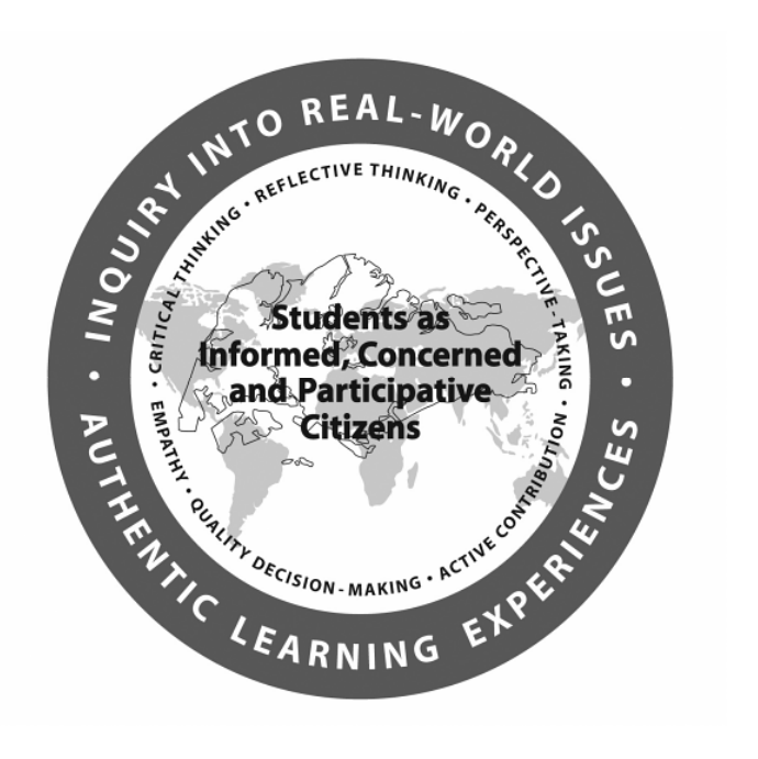
Figure 1.1 The Singapore Social Studies Curriculum