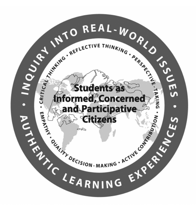
Figure 1.1 The Singapore Social Studies Curriculum

Figure 1.1 reflects the philosophy underpinning the Singapore Social Studies curriculum.