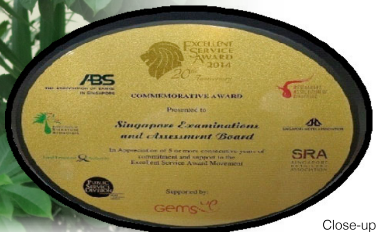
Close-up of SEAB's EXSA Award