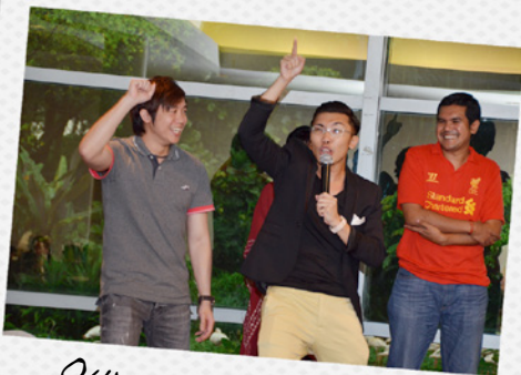
Our emcee leading the dance moves!