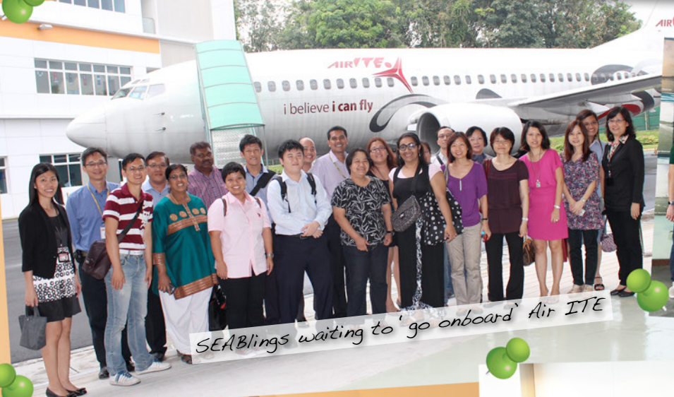
SEABlings waiting to 'go onboard' Air ITE