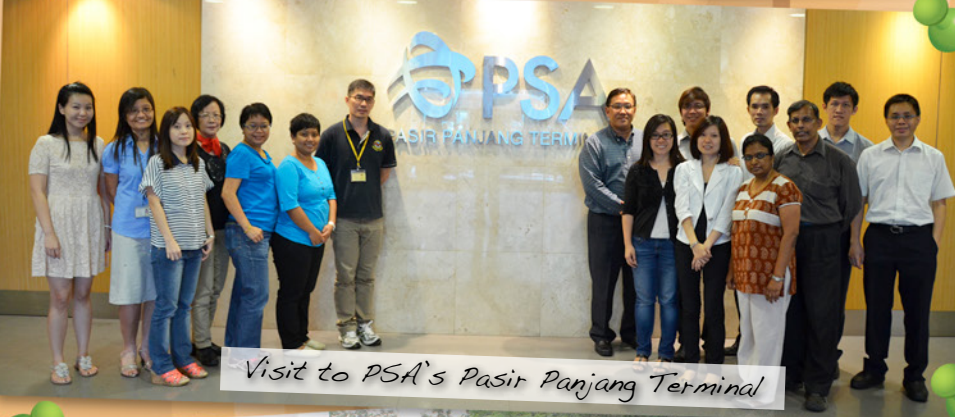
Visit to PSA's Pasir Panjang Terminal