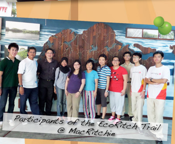
Participants of the EcoRitch Trail @ MacRitchie