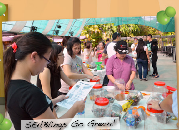
SEABlings Go Green!