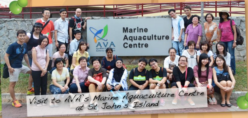
Visit to AVA's Marine Aquaculture Centre at St John's Island