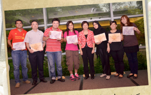
Our proud award winners