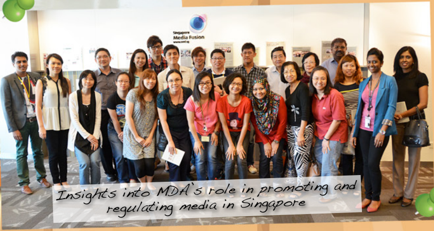
Insights into MDA's role in promoting and regulating media in Singapore