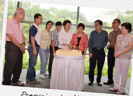
Preparing to blow the birthday candles: "Happy 9th Birthday to us!"