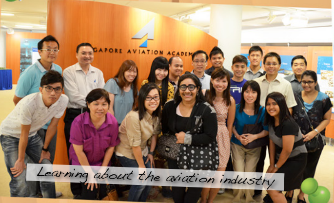
Learning about the aviation industry