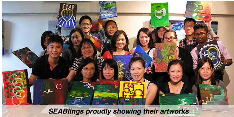
SEABlings proudly showing their artworks

For SEAB staff, there have been many opportunities for taking that 'first step'. Getting to try something different or learning first-hand about what makes another company tick or even leading the whole organisation to attain a complicated but necessary certification. These are but some examples of journeys undertaken by SEABlings, which are the highlights of this e-newsletter issue.