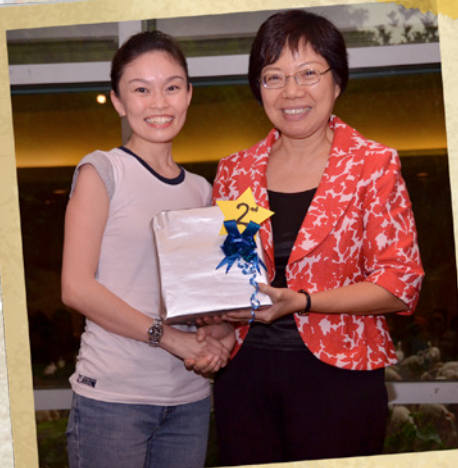
One of our lucky draw winners with CE