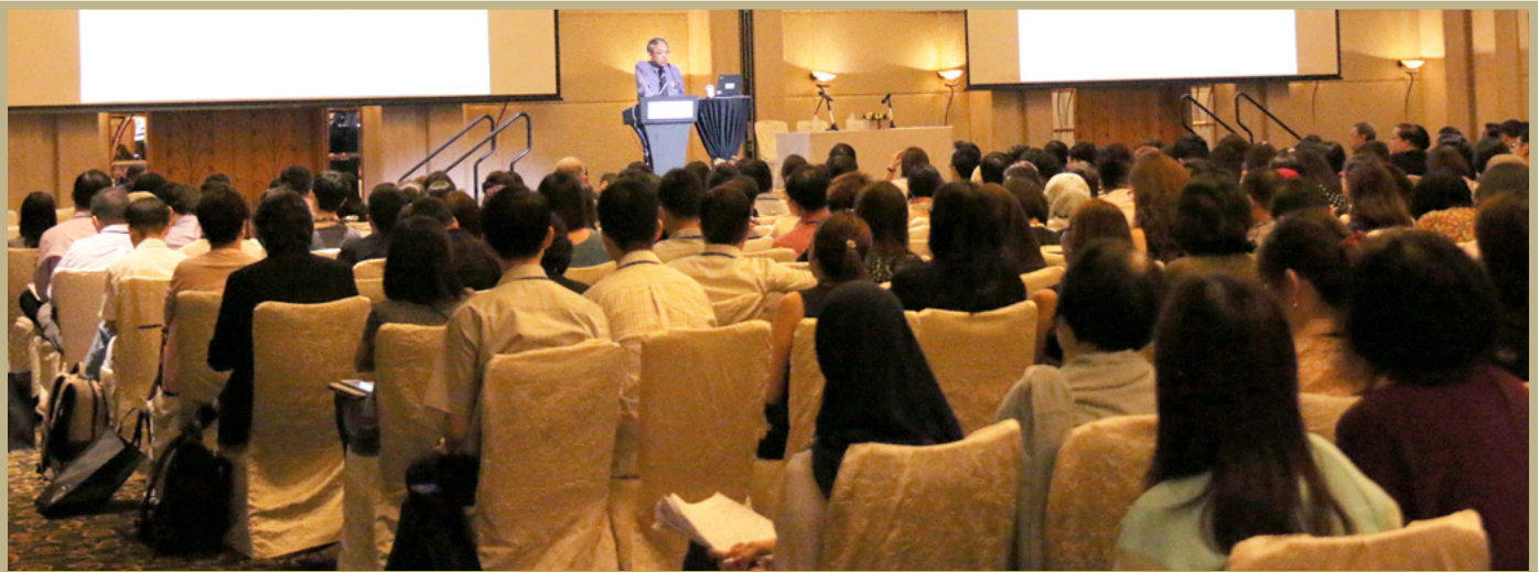
Participants focusing on the presentation.