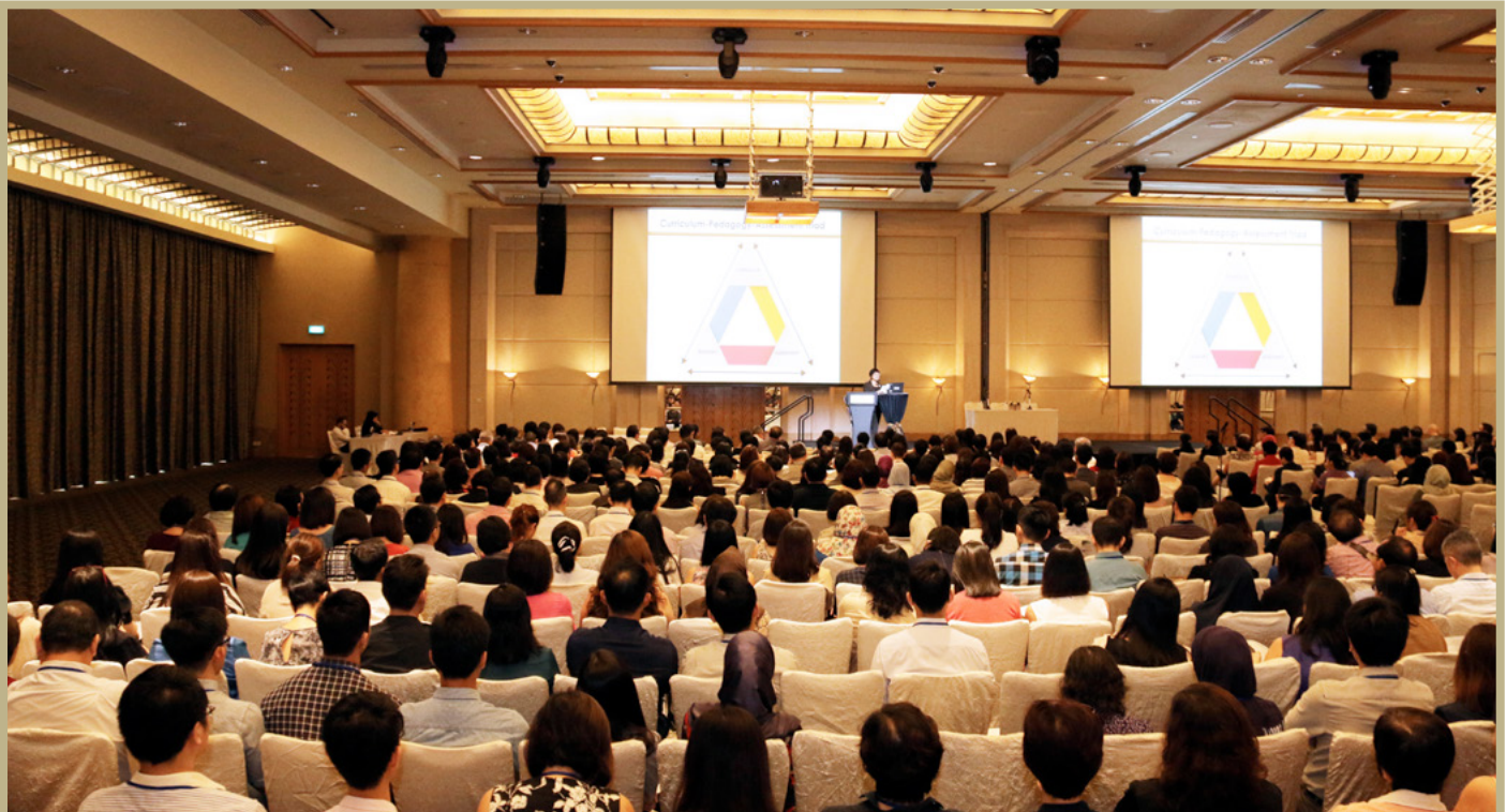
2016 SEAB Assessment Seminar held at the Grand Copthorne Waterfront Hotel.

Welcome to Issue 21 of the SEAB-Link newsletter. It has been an exciting first half of 2016 and we cannot wait to share the details with our readers.