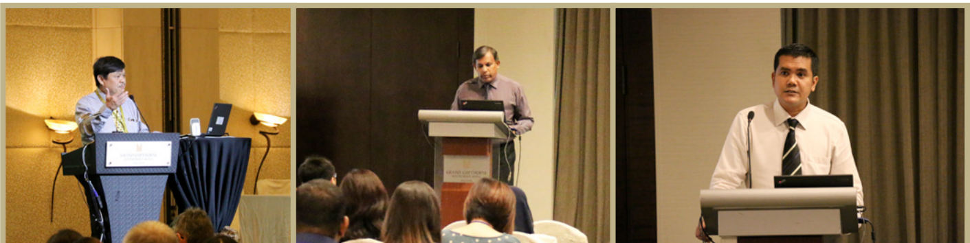
SEAB staff presenting and sharing their assessment experiences with the seminar participants.