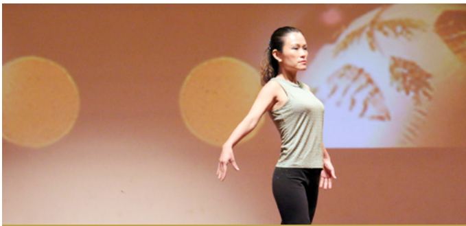
Enchanting the audience with dance choreography