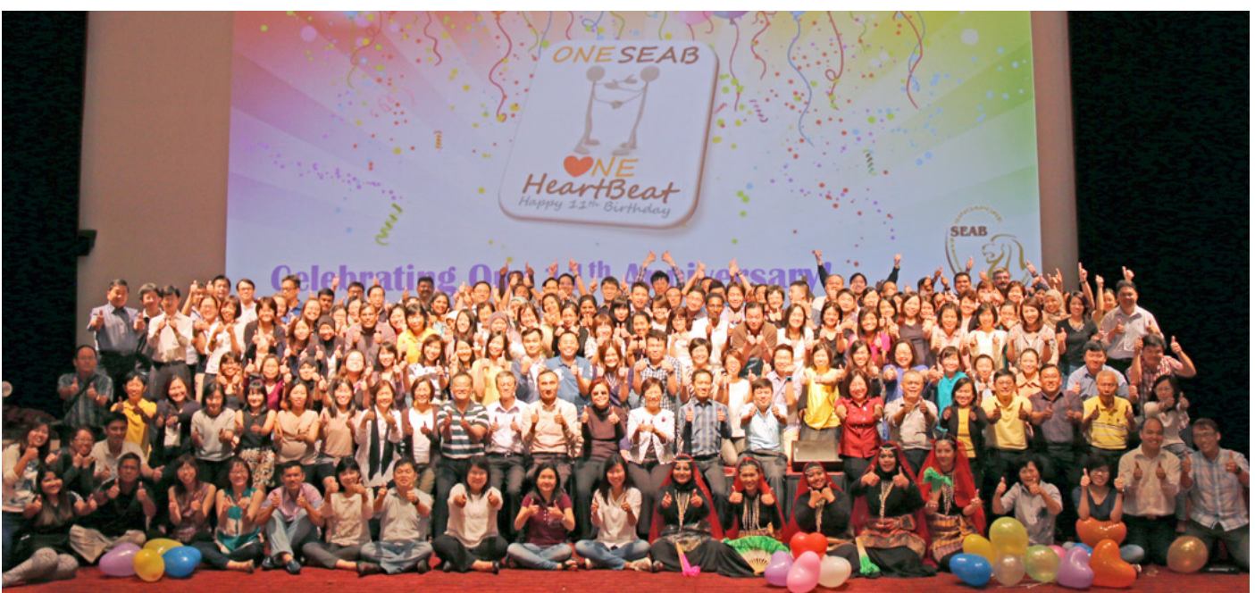
An annual tradition: The SEAB family photo

All in all, it was definitely an enjoyable day for everyone present, which ended with the SEAB family taking a group photograph.