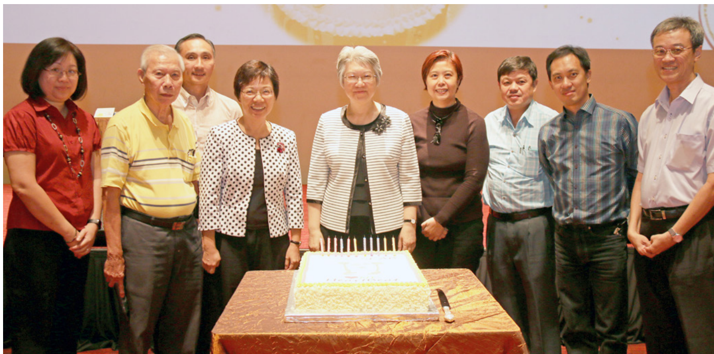
Chairman, CE, senior management and our pioneer generation celebrating our 11th anniversary.

This year, SEAB proudly celebrated our 11th anniversary on 31 March 2015 at Joyden Hall, Bugis+ Mall. It was a day for all staff to get together, mingle, laugh and enjoy the moment as we celebrate the successes in our journey together.