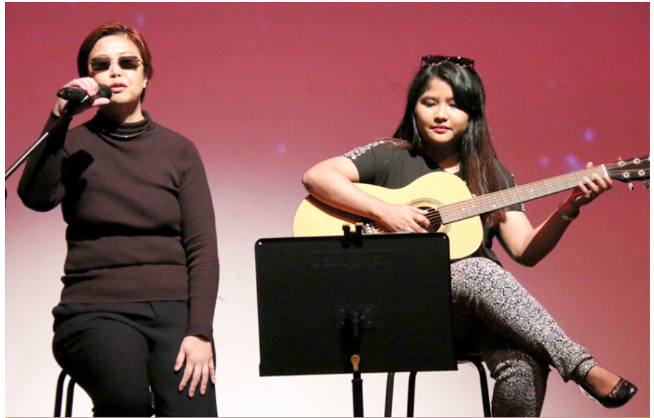
A serenading ballad with guitar accompaniment

The addresses from both Chairman and CE reiterate that every staff counts and all these achievements will not be possible without everyone playing their crucial role.