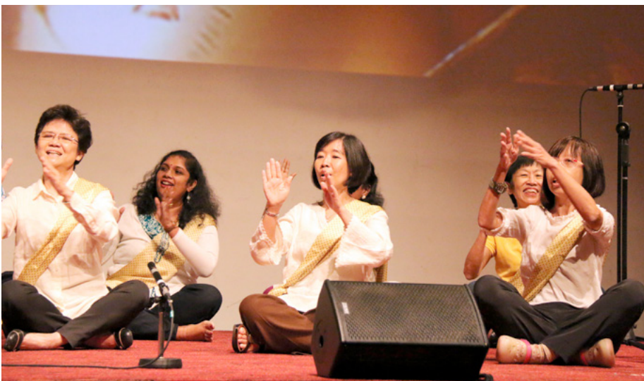
A show of true unity expressed in music and rhythm

Staff participation this year came through in many ways. As a prelude to the SEAB Day celebration, the staff were invited to submit designs for the "EZ-Link Card Design Competition". There were varied and innovative designs submitted by the staff. The winning design was printed on the EZ-Link Card which was given to staff and guests as a commemorative item for the event.