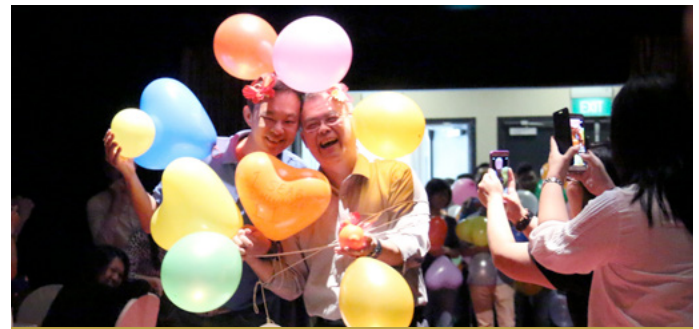
Staff all decked with colourful balloons, ready for the parade