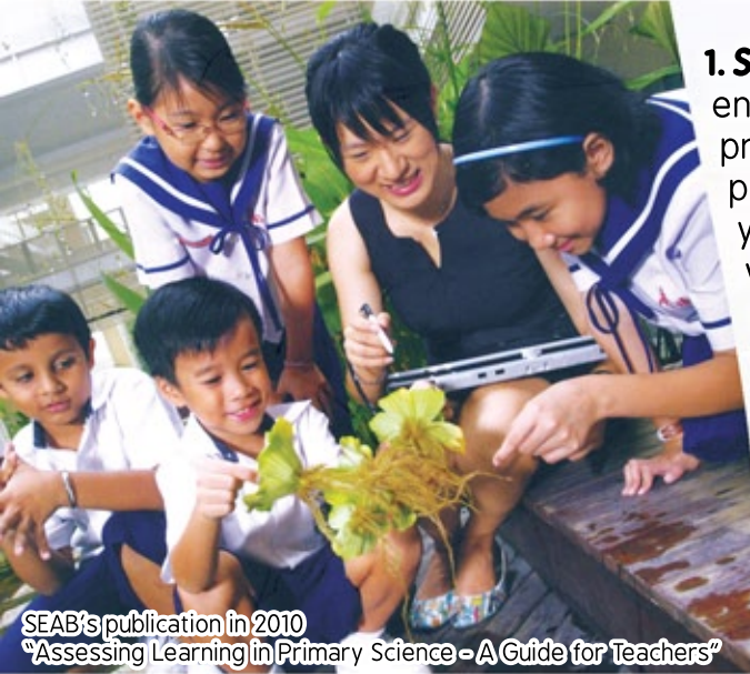
SEAB's publication in 2010 "Assessing Learning in Primary Science - A Guide for Teachers"