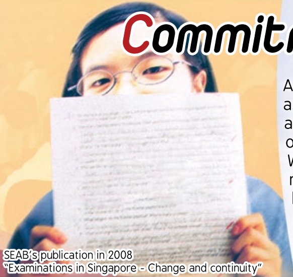
SEAB's publication in 2008 "Examinations in Singapore - Change and continuity"