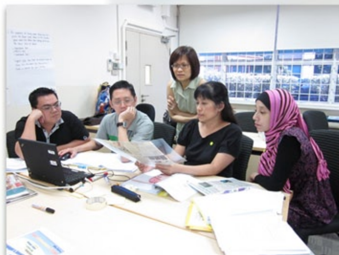
Engaged participants, deep in thought

For more information about training activities in (A) and (B), please refer to TR AISI.